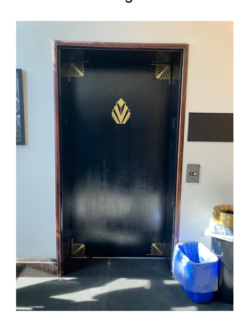
Elevator outside the theater