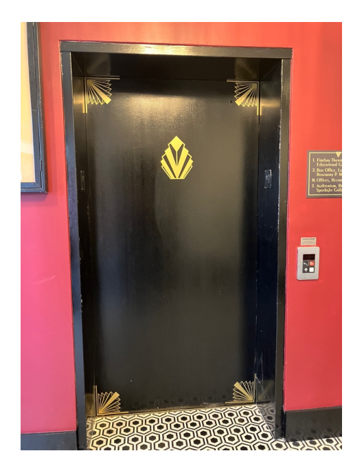
Elevator at 4<sup>th</sup> Street entrance, I can take this to the 3<sup>rd</sup> Floor