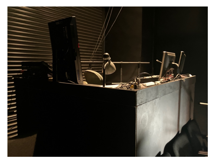
Stage Manager's booth with equipment to run sound and lights