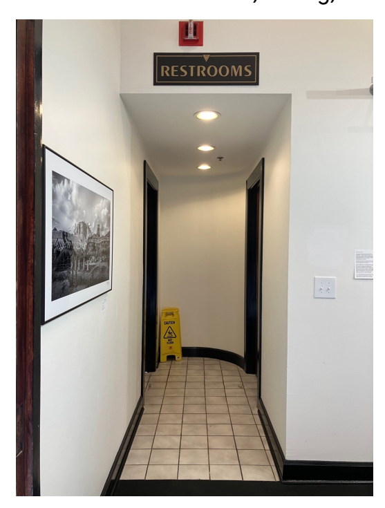
Lobby hallway with bathrooms

I will let my family member know when I have to go to the bathroom. The show is about one hour long. There is no intermission, which means no breaks in the show for the entire audience. I can choose to go to the bathroom before, during, or after the show.