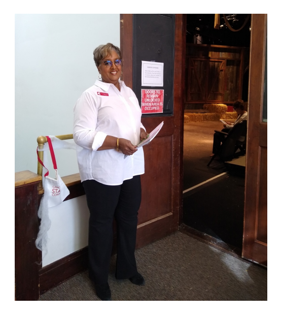
A friendly usher will help me into the theater

An usher will stand at the door of the theatre to collect my ticket. If I need information about what I can do at the theater or where something is located at the theatre, an usher can help me find the information or guide me to the correct place.