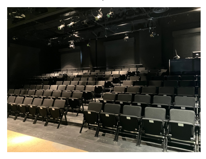
Seating for audience

I can choose to sit in any of the chairs. When choosing my seat, I should consider if I am sensitive to sound (or any of my family members are). The stage manager will sit at a table in the back, close to the door. She will be pushing buttons to control the lights and sounds in the show. These buttons make clicking noises throughout the show. If sound will bother me or a family member, we can sit in the middle of the audience or towards the far end (away from the door). The actors will also high-five and talk to the people sitting in first row of the audience. If we don't want to be talked to or interacted with, we can sit in the second row or further back. I will try to make the best choice for seating for my family.