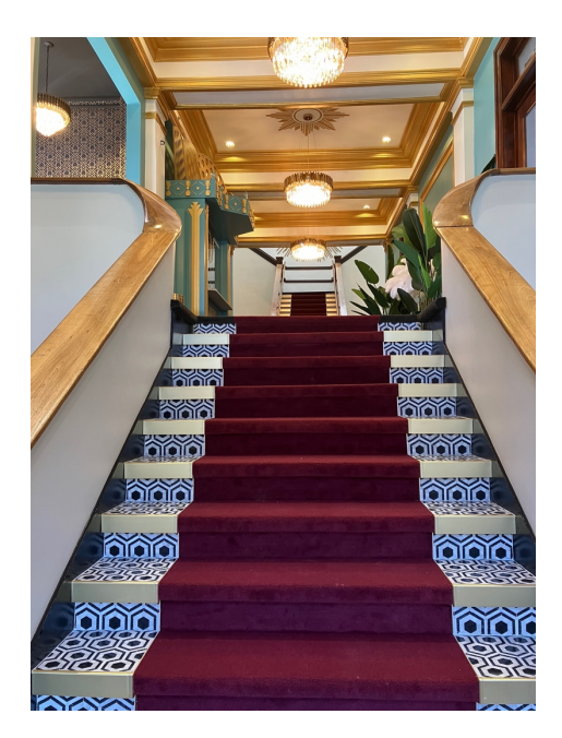
Main lobby and stairs as seen from Walnut Street entrance

Once we are in the door, my family and I can choose to take the elevator or the stairs to the 2nd floor to pick up my tickets, or to the 3rd floor where the show will take place.