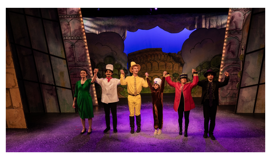
Cast members taking a bow after the performance

At the end of the show, the actors and actresses will bow. During this time, the audience will be clapping to tell the actors they liked the show. I can choose to clap too or cover my ears with my hands or leave my seat to go to the quiet room. I will make the best choice for myself during the times in the show where there are loud noises.