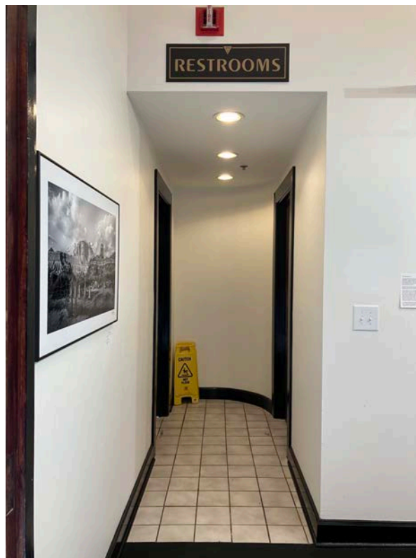
Lobby hallway with bathrooms

I will let my family member know when I have to go to the bathroom. The show is about fifty minutes long. There is no intermission, which means no breaks in the show for the entire audience. I can choose to go to the bathroom before, during, or after the show.