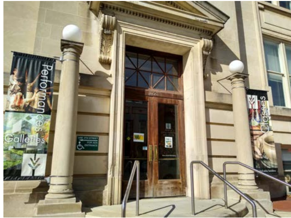
Walnut Street entrance

There are two entrances into the building. One is on Walnut Street and the other is on 4 th Street. My family and I can choose to enter through the door closest to where we parked the car.