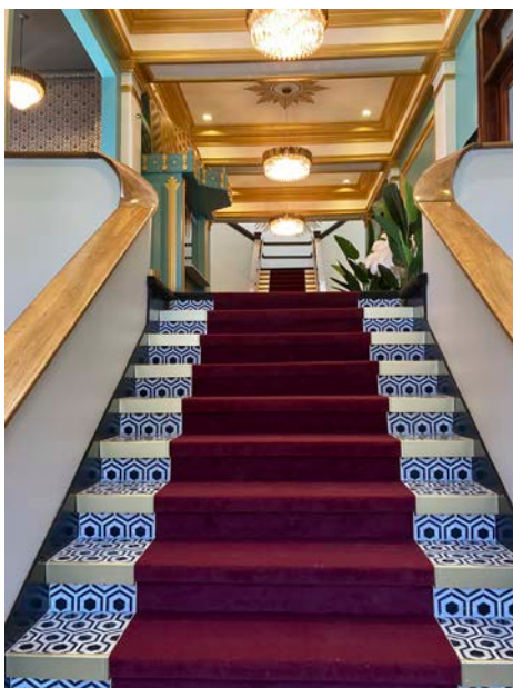
Main lobby and stairs as seen from Walnut Street entrance

Once we are in the door, my family and I can choose to take the elevator or the stairs to the 2 nd floor to pick up my tickets, or to the 3 rd floor where the show will take place.