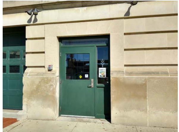
4th Street entrance

Once we are in the door, my family and I can choose to take the elevator or the stairs to the 2 nd floor to pick up my tickets, or to the 3 rd floor where the show will take place.