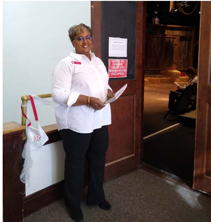
A friendly usher will help me into the theater

An usher will stand at the door of the theatre to collect my ticket. If I need information about what I can do at the theater or where something is located at the theatre, an usher can help me find the information or guide me to the correct place.