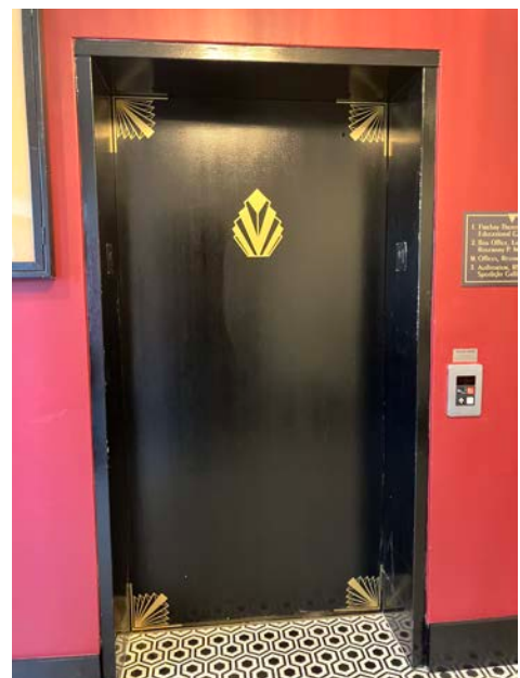
Elevator at 4 th Street entrance, I can take this to the 3 rd Floor