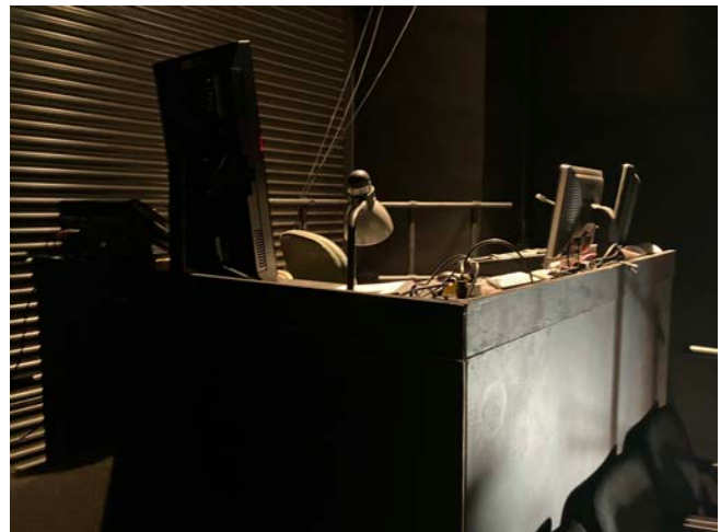
Stage Manager's booth with equipment to run sound and lights