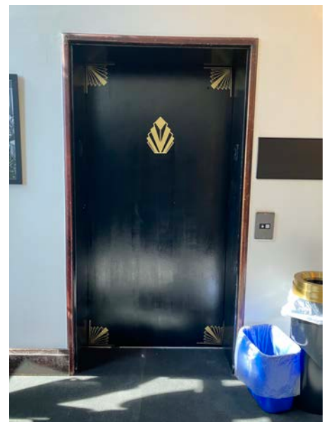
Elevator outside the theater