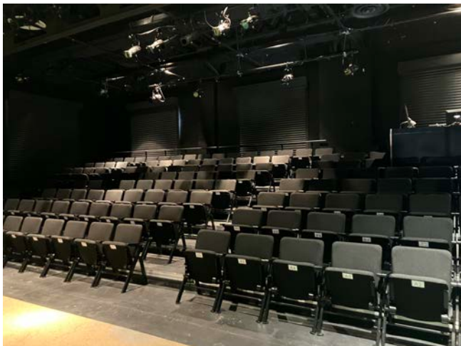
Seating for audience

I can choose to sit in any of the chairs. When choosing my seat, I should consider if I am sensitive to sound (or any of my family members are). The stage manager will sit at a table in the back, close to the door. She will be pushing buttons to control the lights and sounds in the show. These buttons make clicking noises throughout the show. If sound will bother me or a family member, we can sit in the middle of the audience or towards the far end (away from the door). I will try to make the best choice for seating for my family.