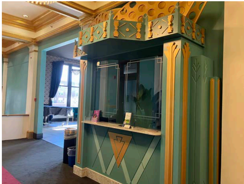
Box office on 2nd Floor for ticket pick-up

Every person must have a ticket to give to the usher to enter the theatre doors. If my family members don't have e-tickets on their phone, then we must stop at the box office to get our tickets. There may be a line that we will need to wait in. I will try to be patient while we wait our turn to get our tickets.